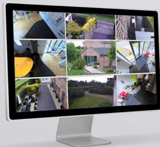
Real Time Monitoring