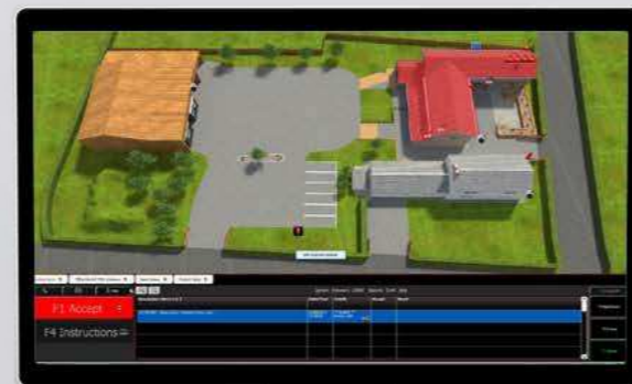
Graphical User Interface (GUI)